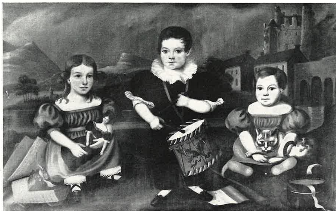
22. Newburgh Family