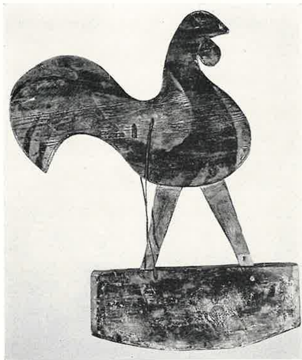
114. Pennsylvania Cock-Weather Vane

110. GAME COCK-WEATHER VANE Anonymous artist Pewter Loaned by The Downtown Gallery, New York City