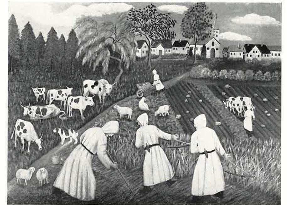
44. Monastery Farm, Rhode Island